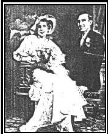
1934 Wedding Photo