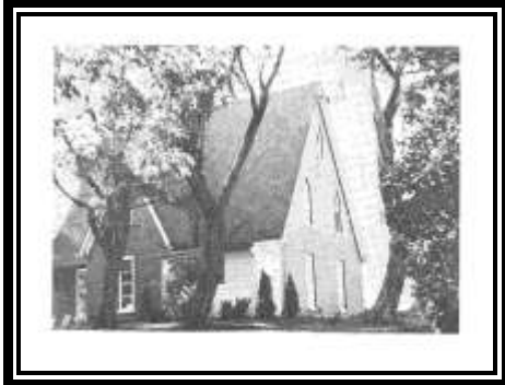
The Christmas Card House